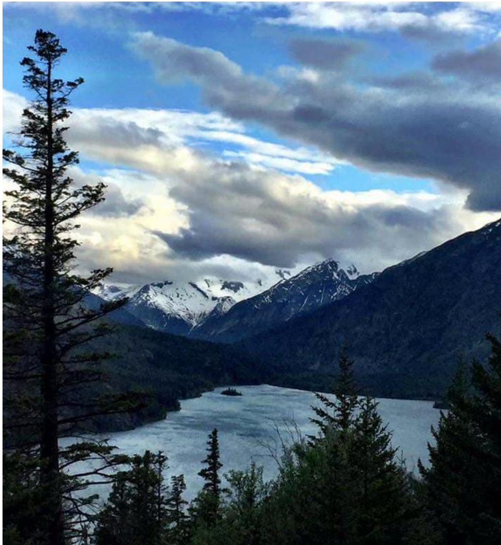
Photo credit to WWIA Guide Jake Whipkey who captured this beautiful shot at the 2017 BC Black Bear Hunt.