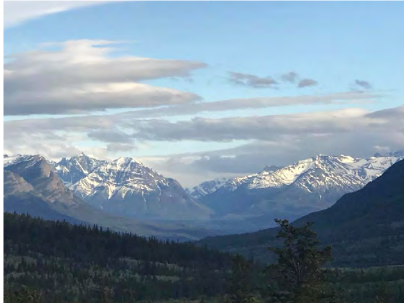
for this amazing landscape shot from the 7th Annual BC Black Bear Hunt