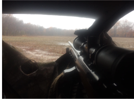
A great vantage point from the 3rd Annual Arkansas Ducks and Ducks Event.