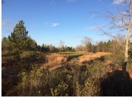
A beautiful view from the 9th Annual Russell AL Deer Hunt.