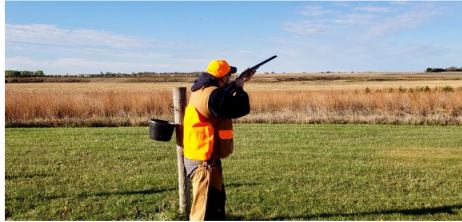
Photo taken at the 10th Annual Grand Ciel Lodge South Dakota Pheasant Hunt