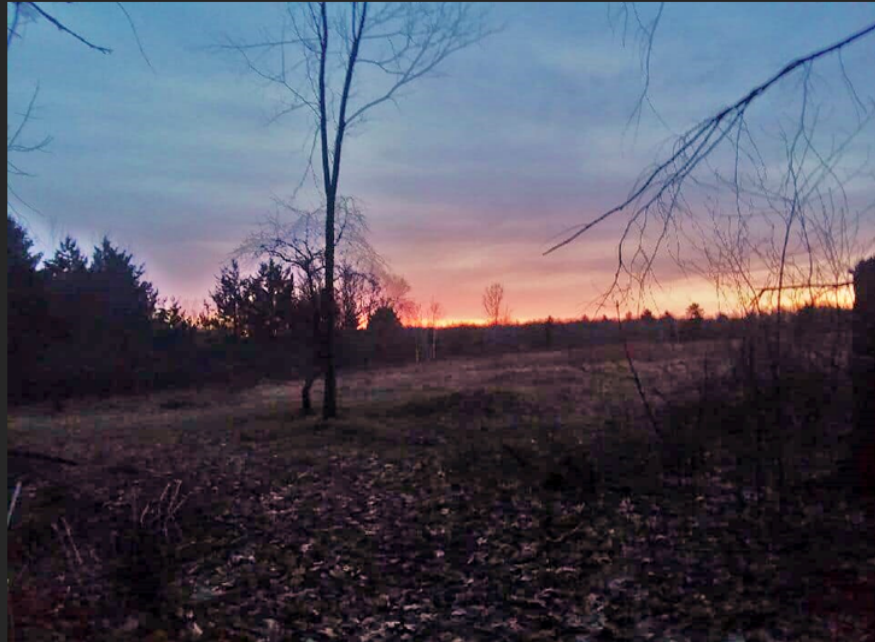
This beautiful shot taken from the 3rd Annual Great Creek Hunt Club Turkey Hunt.