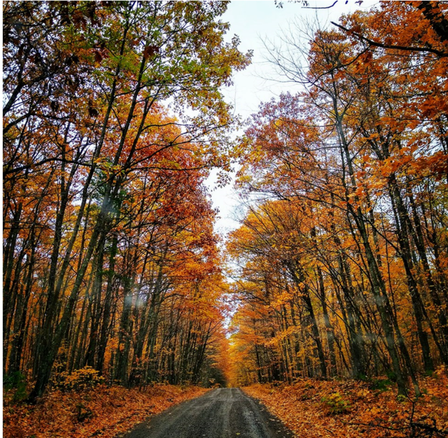
A beautiful fall view from the 7th Annual Bayfield Cast & Blast.