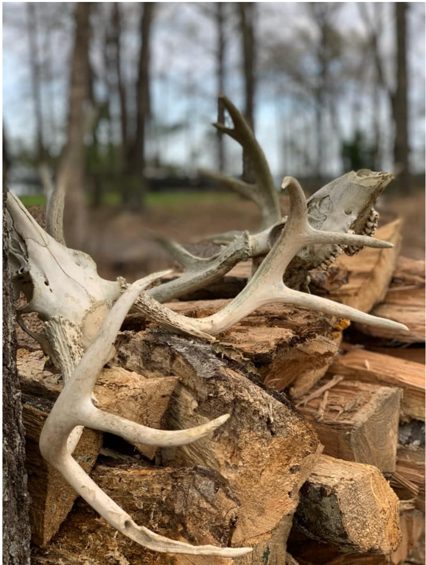
A picturesque shot from the 10th Annual Russell Alabama Deer Hunt.

Welcome to the January/February 2020 edition of Notes From the Field. Building on the successes of 2019, our mission to Honor, Connect, and Heal our Heroes continues into the new year as they are served on world-class sporting events with the love of caring communities with the opportunity to connect with their fellow combat-wounded brothers and sisters. There were five exceptional events in January and February that offered our Heroes the opportunity to hunt deer, hog, quail, chukar, pheasant, duck, and geese. We also hosted our annual woodturning event in Wisconsin, a unique and memorable experience. We're looking forward to a year full of exciting events so stay tuned for more updates and highlights. Last but not least, don't miss our spotlight feature this month introducing you to one of our phenomenal event Hosts. Thank you for all you do to honor and support our incredible Purple Heart Heroes.