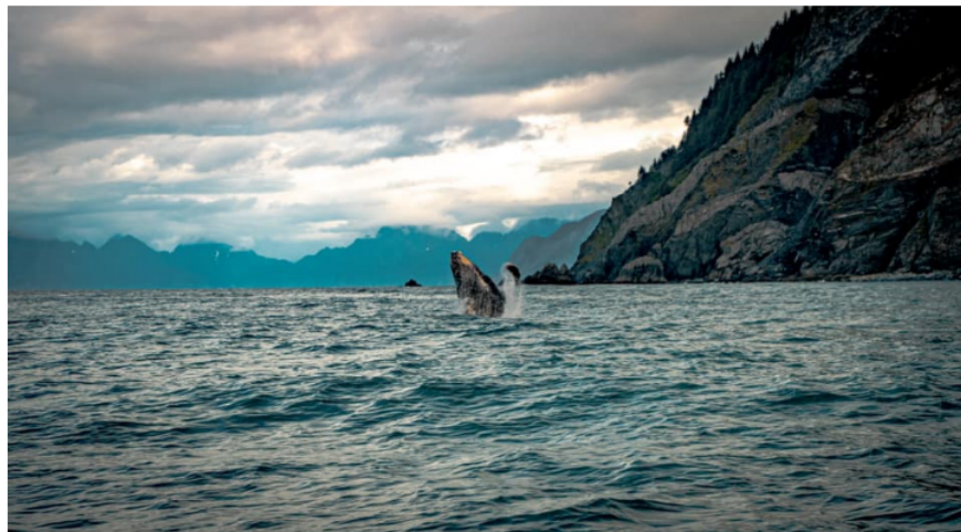
A whale breaking majestically from the waters at the 7th Annual Alaska Halibut Fishing Event.