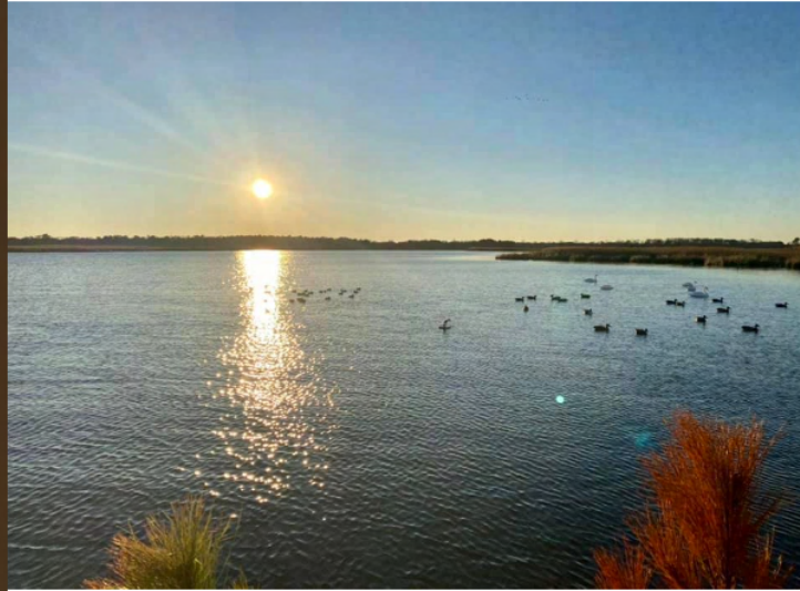
A spectacular scene from the 10th Annual NC OBX Waterfowl Hunt.