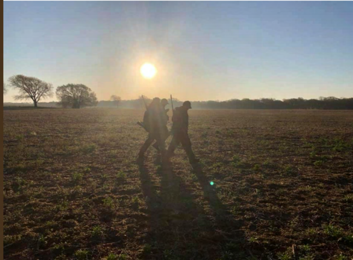
A picturesque scene from the 8th Annual Kansas Cast & Blast in Cawker City, KS.