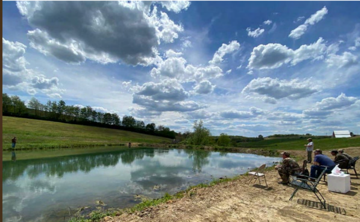
Heroes enjoying an afternoon of fishing at the 6th Annual Western PA Turkey Hunt in Rural Valley, PA.