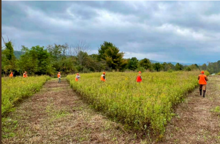
Heroes in the field at WWIA's 8th Annual PA Cast & Blast in Rebersburg, Pennsylvania.

Photo courtesy of WWIA Guides Matt Brannon and Corbin McClanahan.