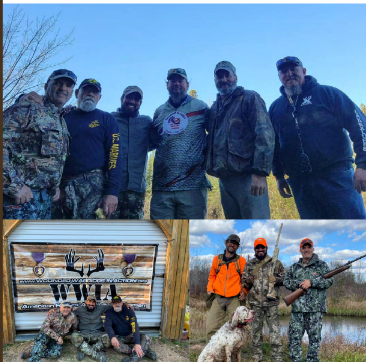
Three of our combat-wounded Warriors traveled to Camp Hackett, the birthplace of WWIA,