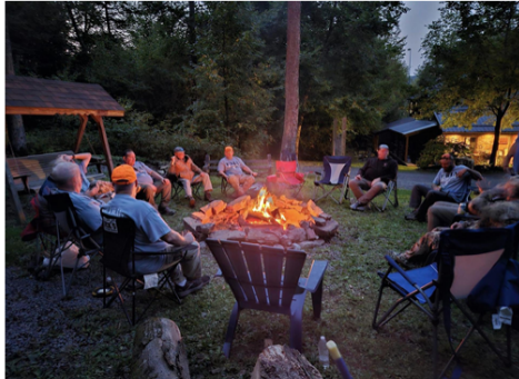
Purple Heart Heroes enjoying time together around the campfire at the 11th Annual Central Pennsylvania Cast & Blast in Rebersburg, PA.

As the summer months were coming to a close, our Heroes took part in ten world-class events across the United States. From bear hunting in the Northwoods of Wisconsin to fishing in the Louisiana bayou, our Heroes had plenty of amazing opportunities to come together, make connections, and enjoy themselves in the great outdoors. We also had many phenomenal fundraisers take place during August and September thanks to the remarkable efforts of so many selfless friends and supporters of the Foundation. We encourage to read all about our events, fundraisers, and more, and hope you'll share this newsletter with your friends, colleagues, and family. As always, we appreciate your tremendous support and thank you for helping us accomplish our mission of honoring and serving America's combat-wounded Purple Heart Heroes. 💜